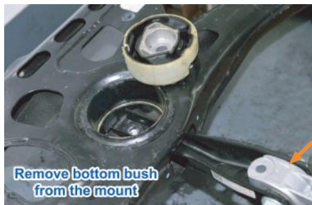
Engine mount connecting rod.