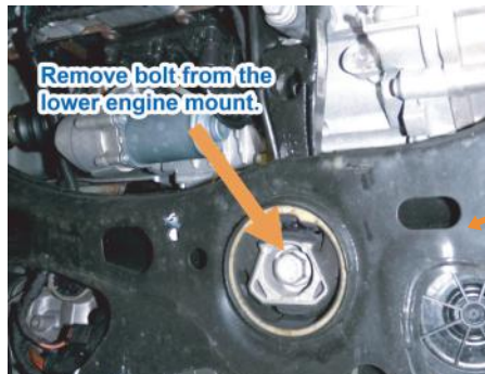
Bottom view of the front subframe